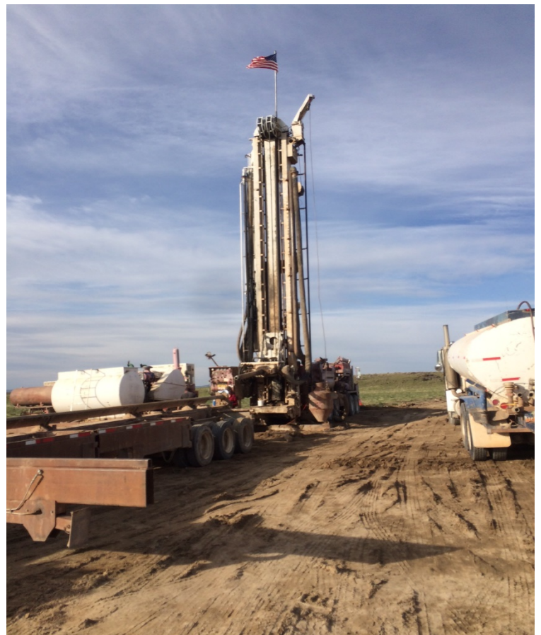
Red Valley: Drilling commences

The campaign is anticipated to be a circa 25 day drill program. Precise timing is dependent on weather, and quality of access to the other two drill locations. Conditions continue to improve however Utah has experienced an unusually high rainfall and late snowfall which has impacted some areas in terms of access for heavy equipment.