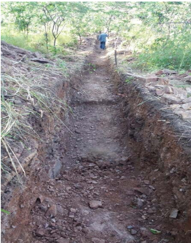
Trenching Work at Mukabe-Kasari